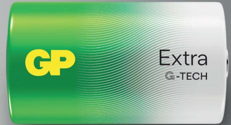
Model No.: GP13AX

Manufacturer reserves the right to alter or amend the design, model and specification without prior notice. Copyright© GPI International Ltd. - All rights reserved